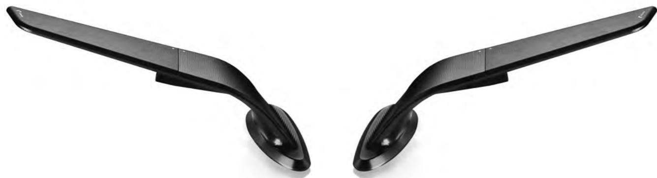
Stealth Sport Mount BSS031B