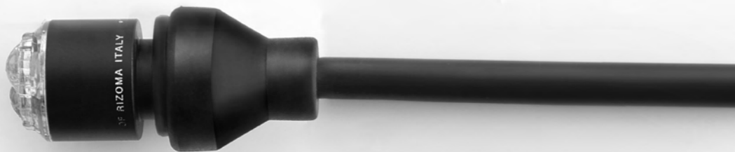
Light Unit Turn signals FR070BM