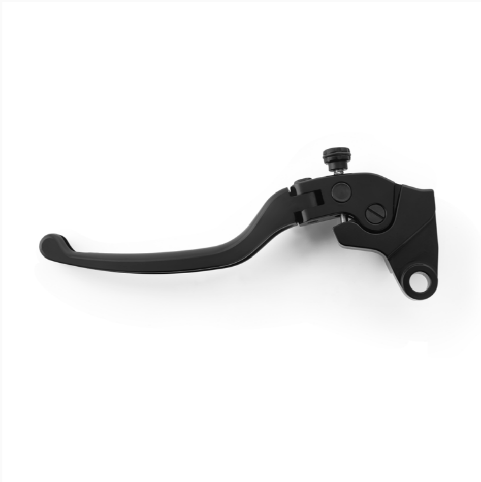
3D Clutch levers