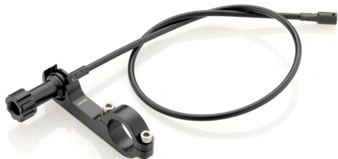
Remote adjuster for brake lever RM050B