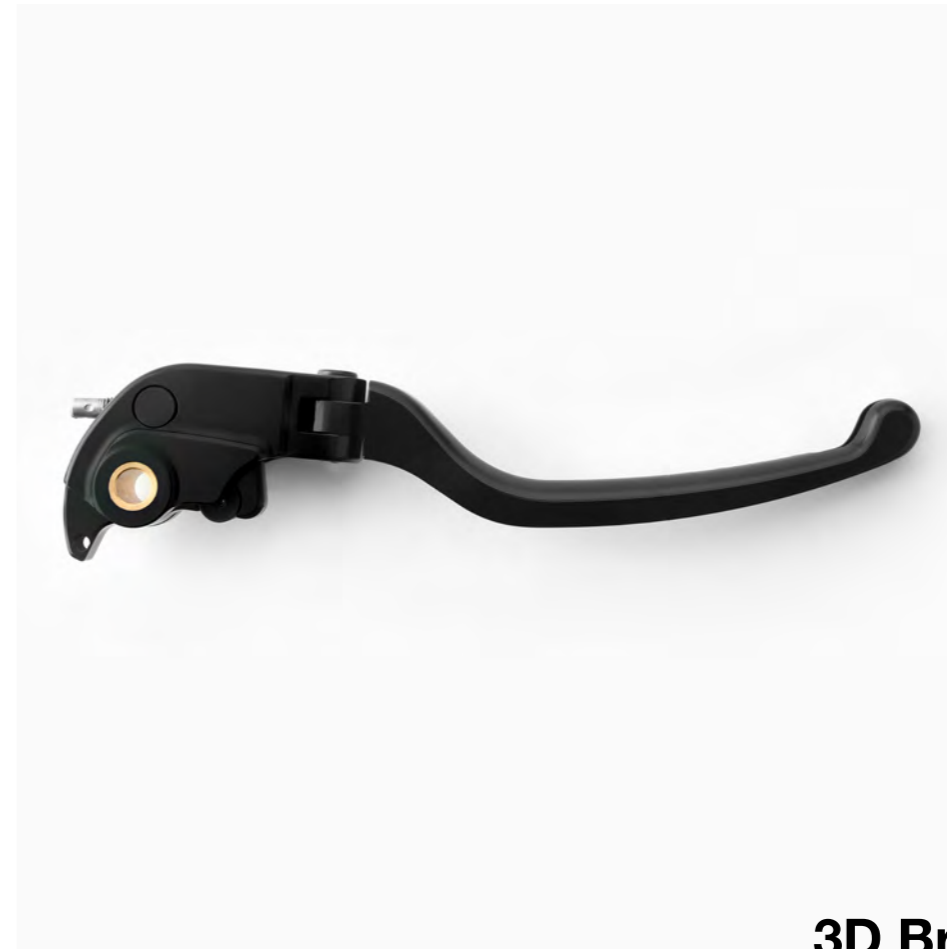
3D Brake lever with Remote Adjuster predisposition